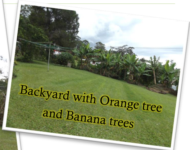
Backyard with Orange tree and Banana trees